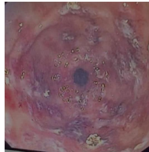
GAVE : Post-APC