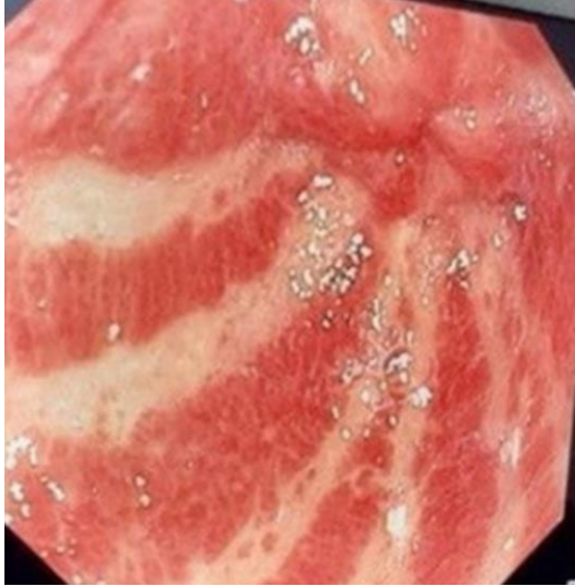
GAVE : « Watermelon stomach »